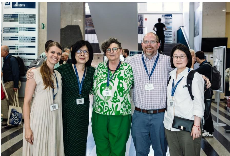
(11) Conference participants Interaction